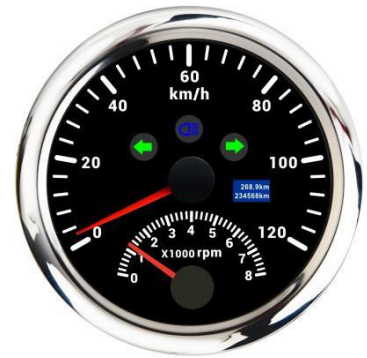
GPS installation instructions

Put the gauge in the hole and screw down.