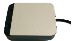
Can't receive GPS signal