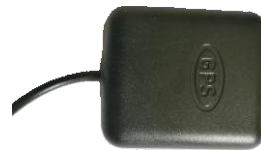
Installed in front